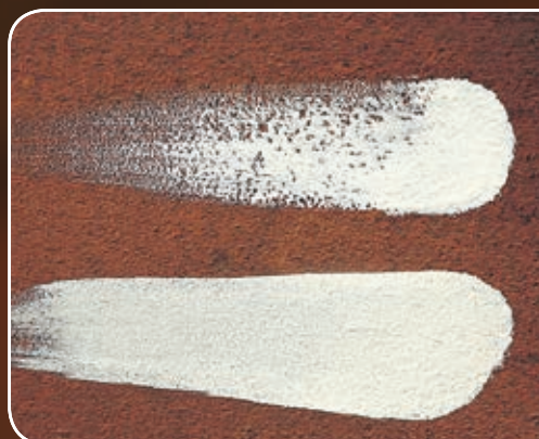
Photo compares one brush stroke of quality primer (top), with one stroke of the same primer mixed with Owatrol® Oil. The difference is what makes Owatrol® Oil. such a success as a quality paint conditioner.

Owatrol® Oil gives better results with wood and metal primers: